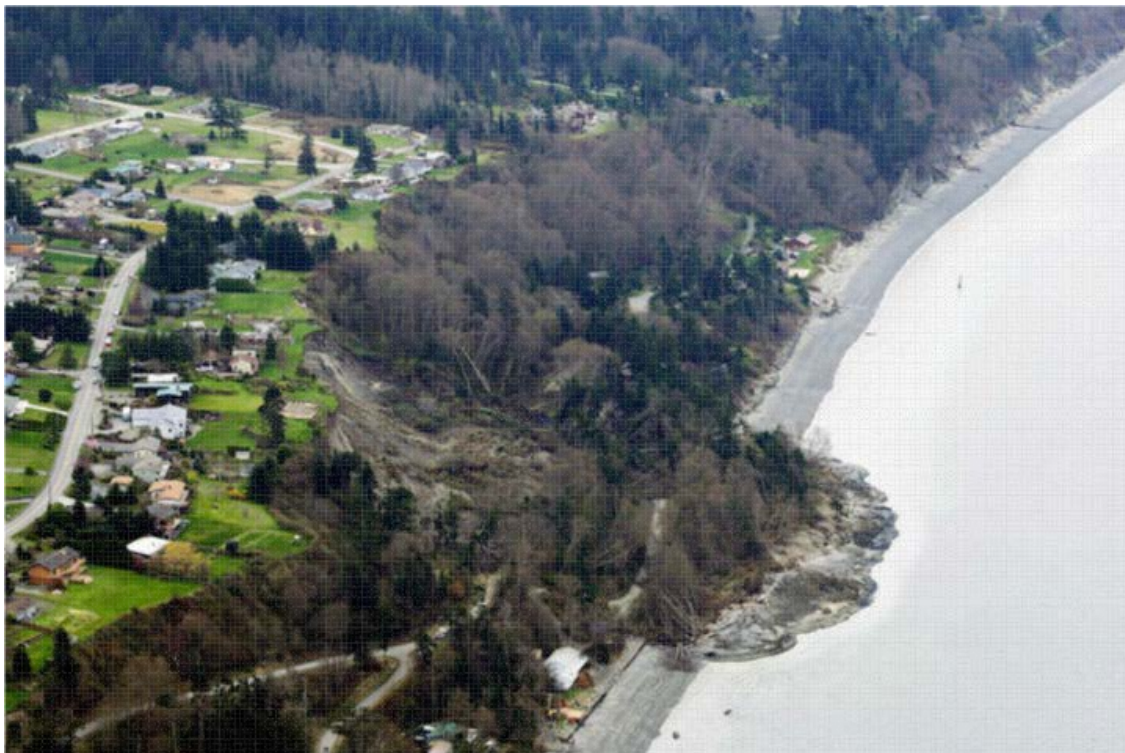
Figure 8: Landslide in glacial sediments, Puget Sound