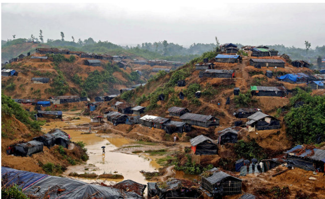
Figure 6: The recently built Rohingya refugee camps in Ukhia and Teknaf in Cox's Bazar have damaged the biodiversity of the area, conservationists say.