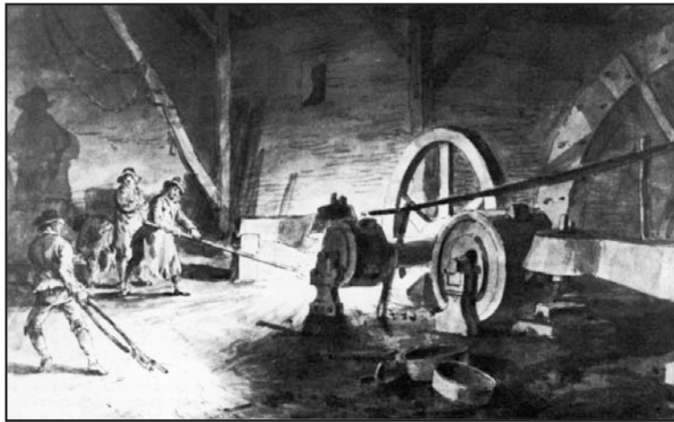
[Iron workers at Merthyr Tydfil in the early nineteenth century]

(a) Use Source A and your own knowledge to describe working conditions in Merthyr Tydfil in the early nineteenth century. [3]